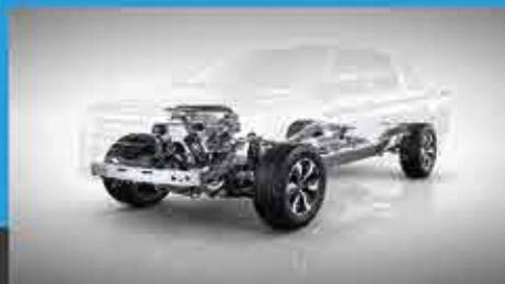
Advanced 8 th Generation International Midsize Pickup Platform