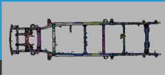
Exclusive 9-crossbeam Structure