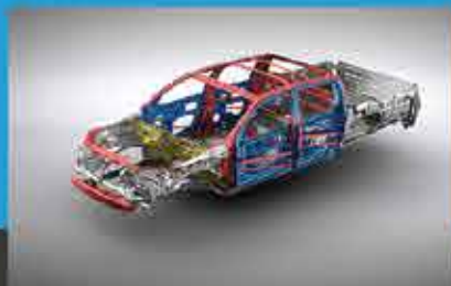
"Birdcage" Frame Structure + High-strength Steel Proportion Reaches 43% Double Side Door Impact Beams Design